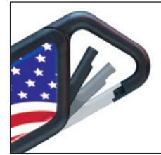
Tri-Ring® Clip features a coil spring for smooth opening and automatic closing.