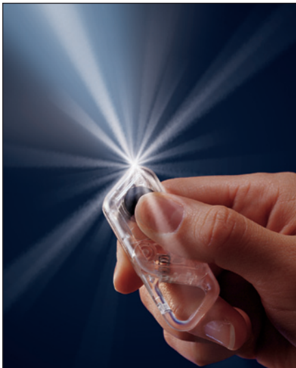
Mirage® . . . crystal clear illumination.