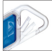
Tri-Ring® Clip features a coil spring for smooth opening and automatic closing.