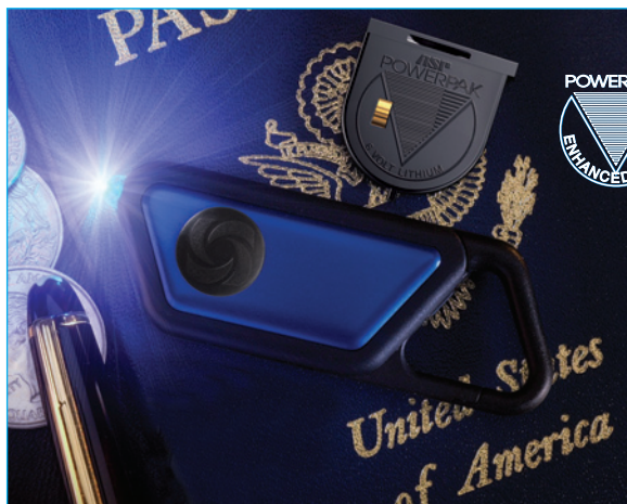
ASP Elite® . . . the high intensity, forged aluminum, 3-mode light.

Genuine ASP Look for the colored panels and contrasting frame.