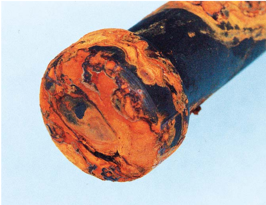
Corroded end tube and tip on competitive sample after 27-hour salt fog exposure.