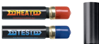
PALM INSERTS HEAT (OC) | 54910 TEST (INERT) | 54911 CONVERSION TUBE | 52839