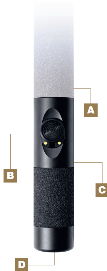
TACTICAL DEFENDER | 52854