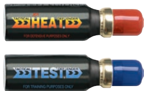
TACTICAL INSERTS HEAT (OC) | 52810 TEST (INERT) | 52811