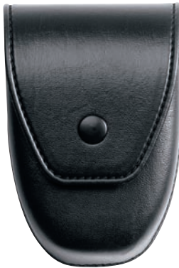
DUTY | 56131

forged ASP Pentagon Handcuff Key is concealed from the public, yet easily accessible to the officer. It is not tied to the operator or the equipment.