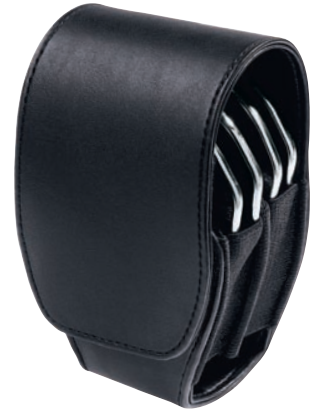
DOUBLE | 56160