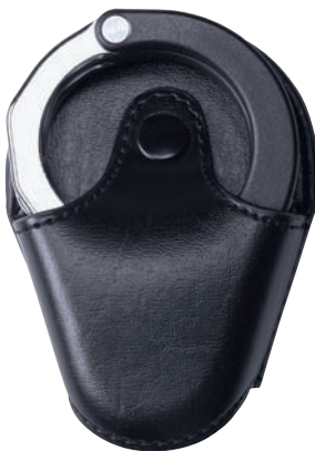
FEDERAL | 56138