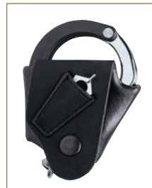
INVESTIGATOR | 56134

FEDERAL cuff carriers have an inset back and pull through retention strap.