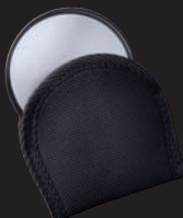
MIRROR PAGE 24